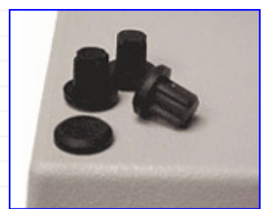
Non-Skid Feet (P/N 50) RETURN TO TOP