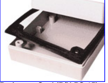
Perimeter Seal (P/N PS-15)